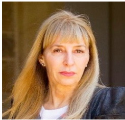
Baroness Susan Greenfield Neuroscientist, Author & Broadcaster Oxford UK